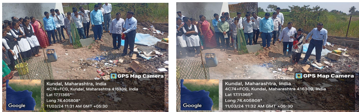
Hands on Training of Fire Extinguisher to the Student